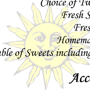
Table of Sweets including Cakes, Trifle and Chocolate Mousse